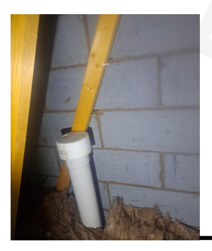
Issue 3: Loft

Remove surplus 4 x 1 left by carpenter attention required.