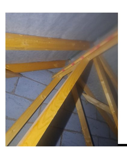
Issue 1: Loft